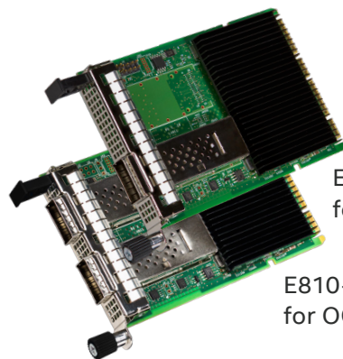
E810-CQDA1 for OCP 3.0