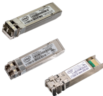
Intel Ethernet SFP28 Optics (SR, and SR and LR extended temp)

Intel Ethernet Optics and Active Optic Cables (AOCs) support multiple configurations and are fully compatible with the Intel Ethernet Network Adapter E810-XXVDA4.